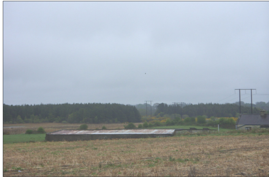
Plate 2: Existing 110 kV overhead line at Lough Sheever Fen / Slevin's Lough Complex