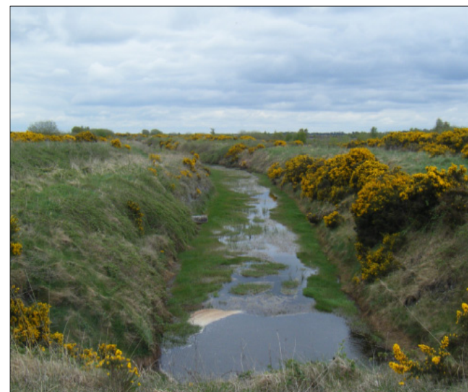
Plate 5: The Mongagh River (southeast of Rochfortbridge)