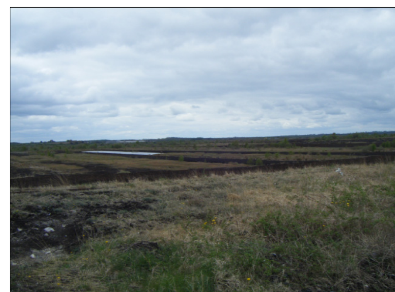
Plate 6: Recolonising cutover bog habitat