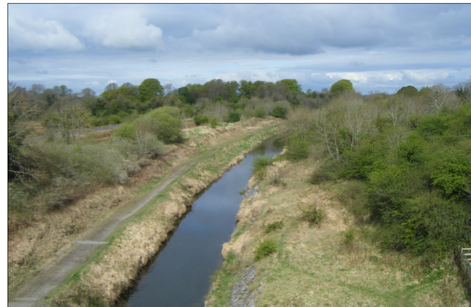
Plate 3: Royal Canal at Boardstown