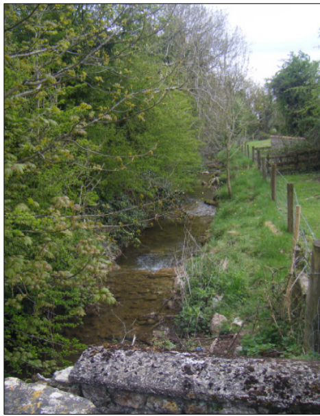
Plate 1: Lough Ennell tributary at Dysart