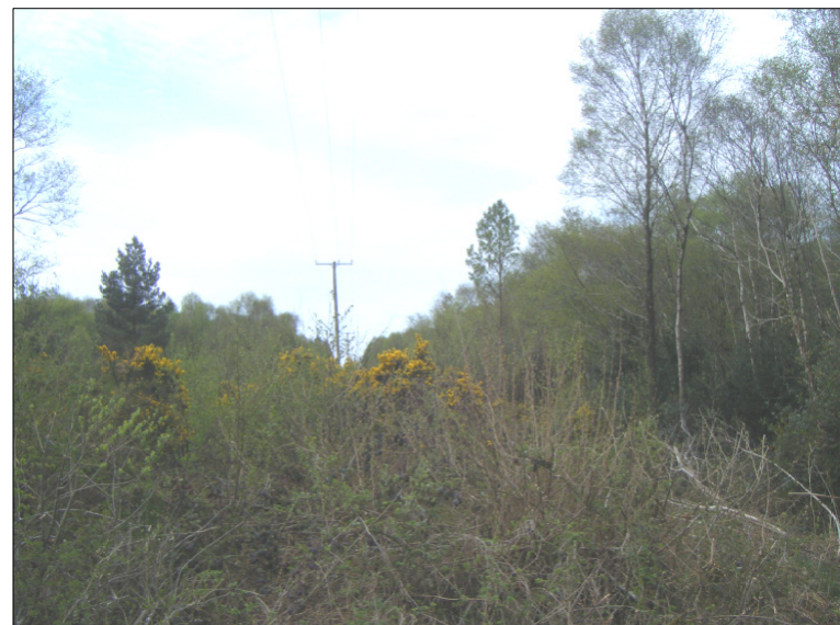
Plate 4: Woodland at Dalystown