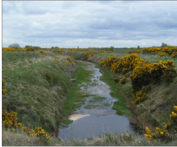
Plate 1: The Mongagh River (southeast of Rochfortbridge)