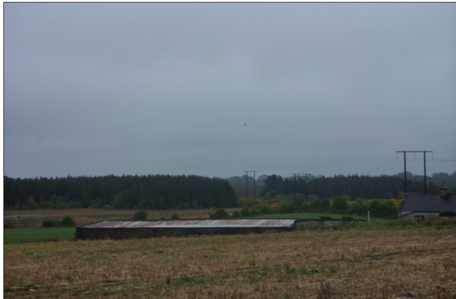
Plate 3: Existing 110 kV overhead line at Lough Sheever Fen / Slevin's Lough Complex