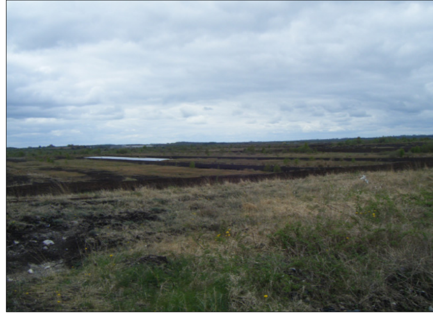
Plate 2: Recolonising cutover bog habitat