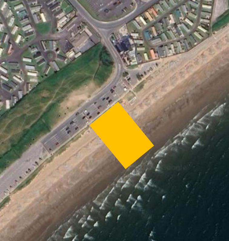
Phase 3: Beach works December 2024 - April 2025