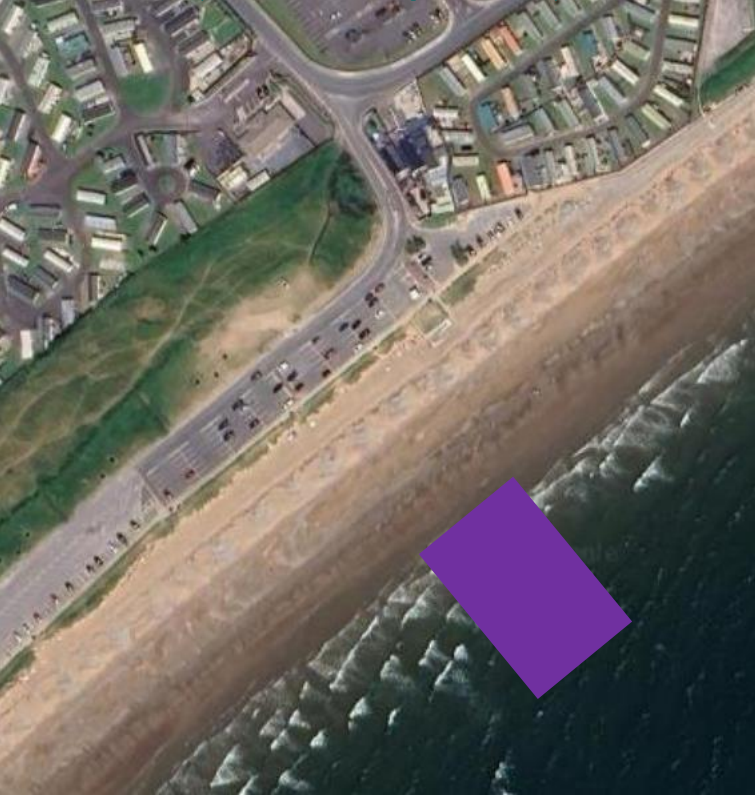
Phase 4: Offshore Works April 2025 - June 2025 (Weather Dependant)