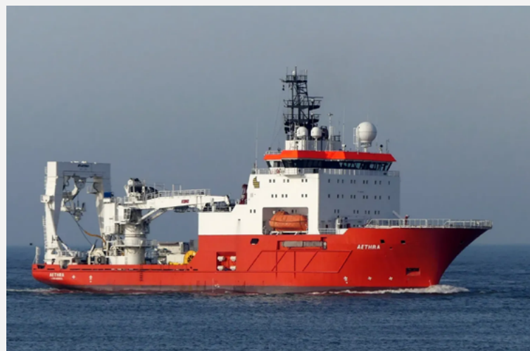
Vessel Aethra is currently undertaking boulder clearance operations.

Pre-trenching will take place with the vessel AETHRA in offshore areas only.