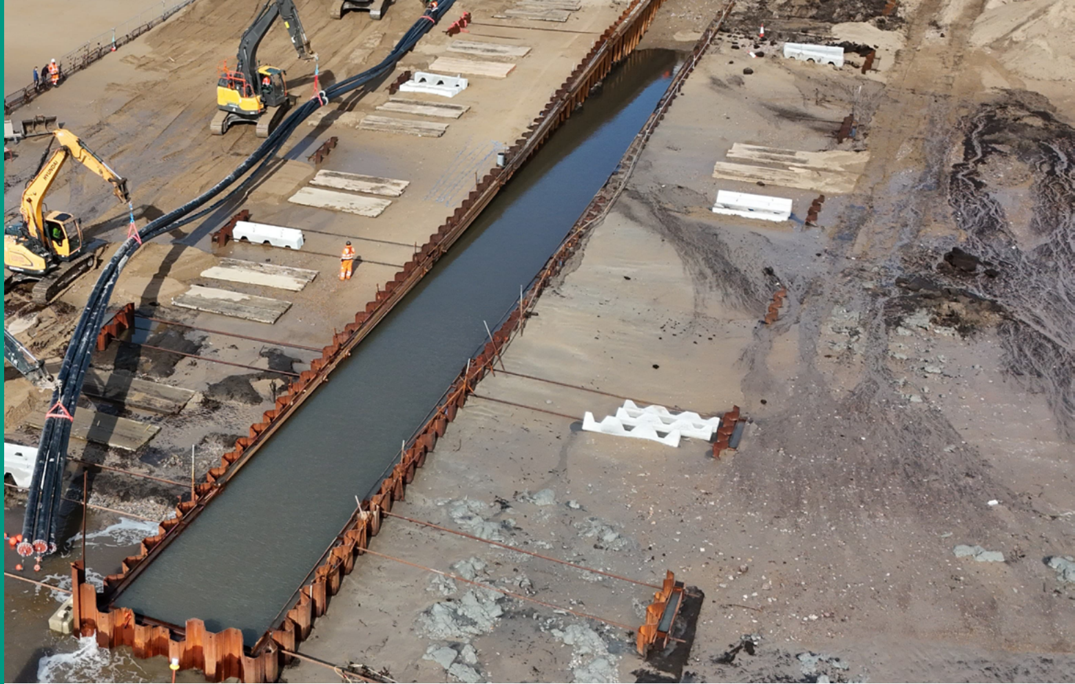
Ducting pipes being lifted synchronously to the cofferdam (trench) at Claycastle Beach, March 2025.