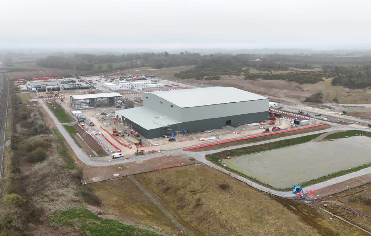
Works progressing at the converter station site, Ballyadam.