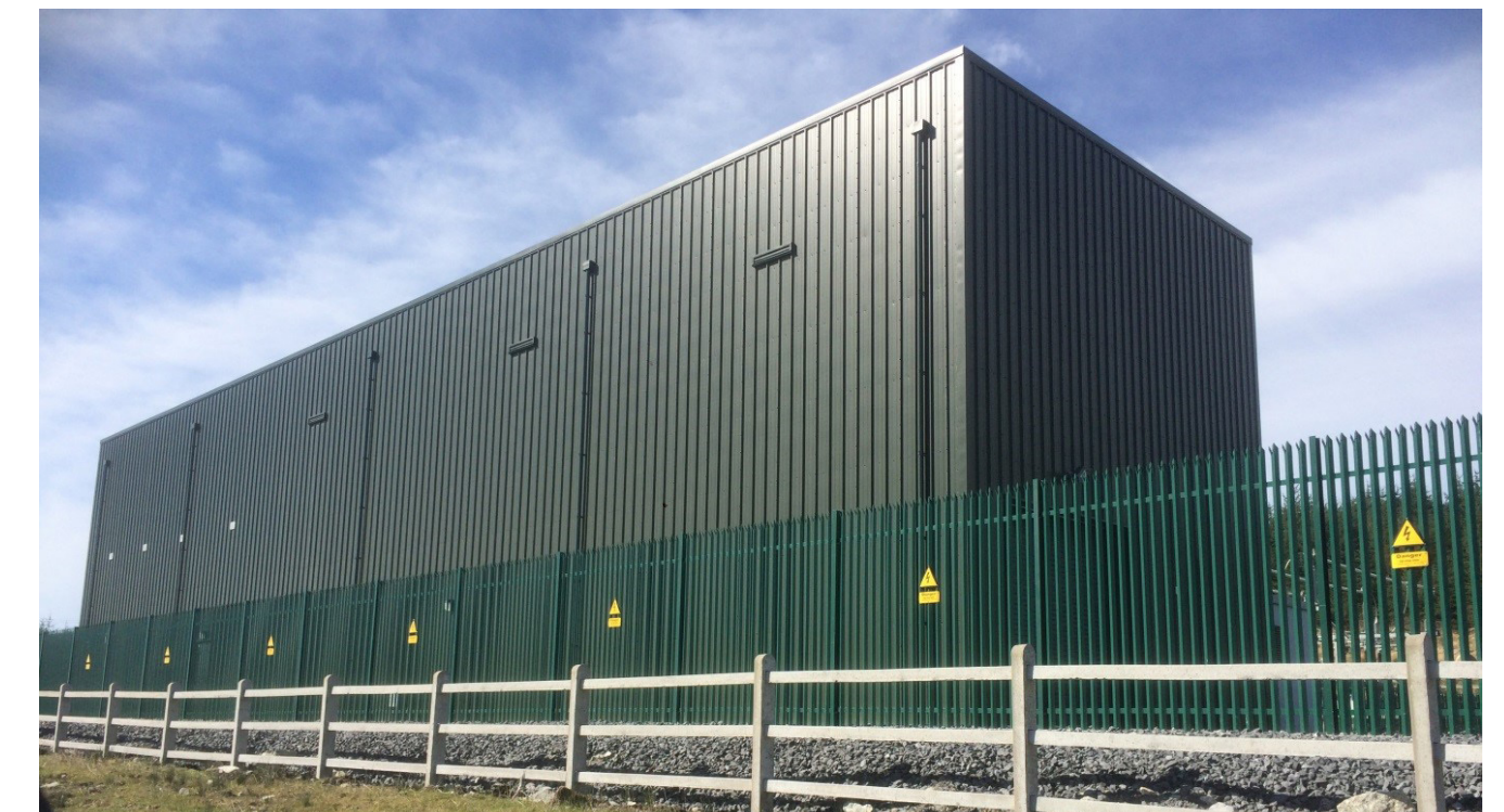
Example of the proposed Substation at Kilpaddoge

Construction of the Cross-Shannon Cable Project is expected to begin in 2021 and operational in 2023.