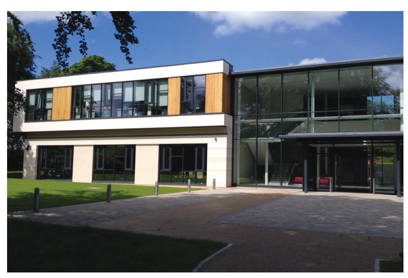
SONI Ltd Headquarters, Castlereagh House, Belfast

• Proposing to construct approximately 10 kilometers of 110kV overhead transmission line to connect the two substations.