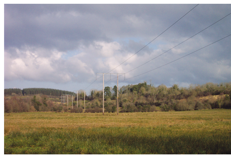
A typical 110kV overhead line

SONI Curraghamulkin 110kV Renewables Project page 2