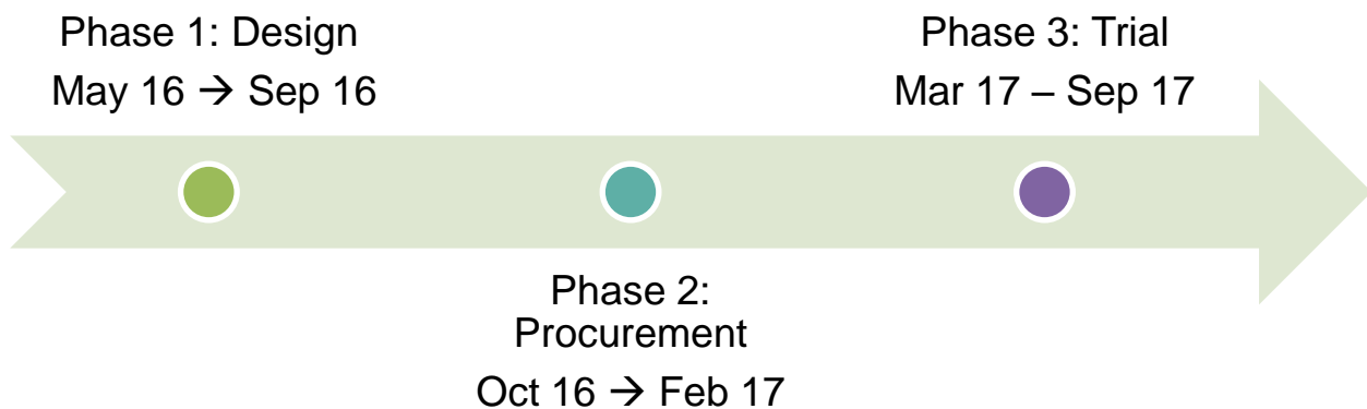
Figure 1 – Timeline for initial Qualification Trial Process

The 14 System Services can be categorised as follows: