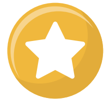
Reviewing the Stakeholder Map

We start by asking the following questions: