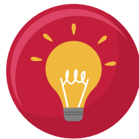
Creating the Stakeholder Map