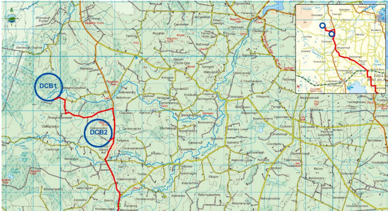
Appendix 12 Figure 4 North Mayo HVDC Converter Station Locations