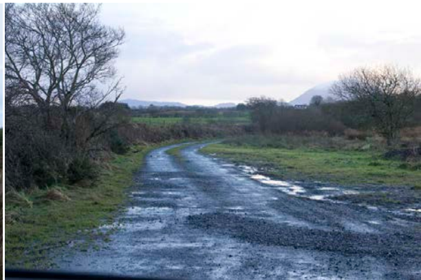
Appendix 12 Figure 2 Typical View of Location DCB1