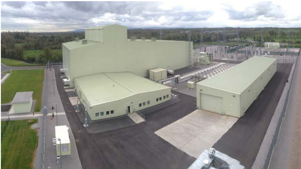
Appendix 12 Figure 1 Existing 500MW Converter Station of the East West Interconnector in Woodland, County Meath

A photograph of the existing 500MW converter station of the East West Interconnector in Woodland, Co. Meath is shown below in Figure 1. It is expected that a Generation 4 multilevel VSC station would be used for the Grid West project, which would be approximately the same size as that shown in the Figure. The size of the compound to house such a converter station would require approximately 180m x 120m or 5.34 acres.