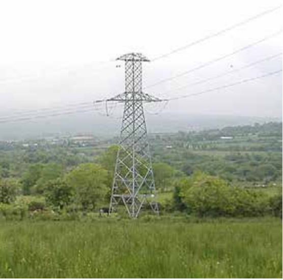
Typical 110 kV pylon (steel lattice tower)