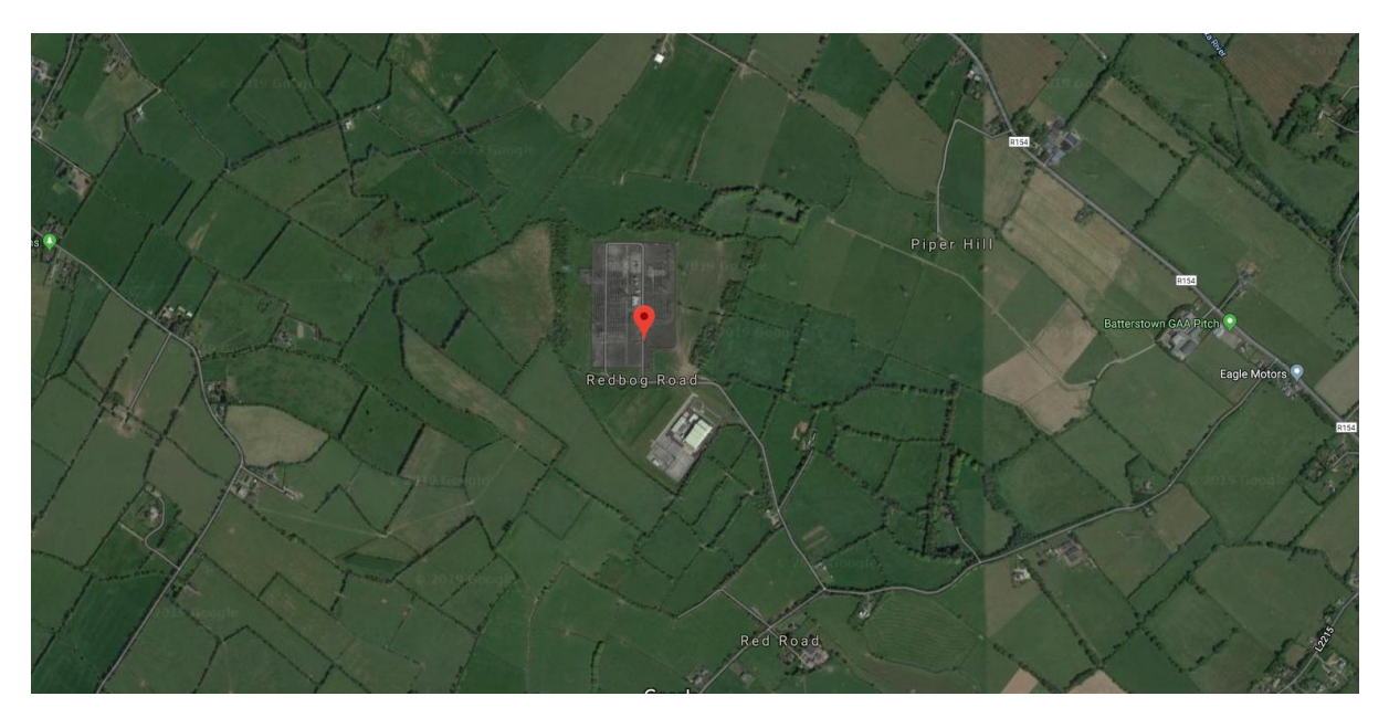
Figure 2: Site Map (From Google Earth)

The substation presently contains both 400kV and 220kV equipment in a double busbar arrangement with 3 \times 400/220kV transformer bays, 2 \times 400kV line bays and 4 \times 220kV line bays.