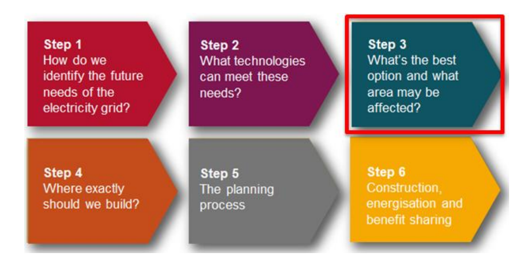
Figure 1: EirGrid's Six-Step Framework for Grid Development

Capital Project 966 is in Step 3 of the above process. The aim of Step 3 is to identify a best performing solution option to the need identified. There are four remaining technical viable options to be investigated in Step 3. All options create a connection between Woodland and Dunstown substations and have common reinforcements associated in relation to voltage support devices and 110 kV uprates. The main four options are: