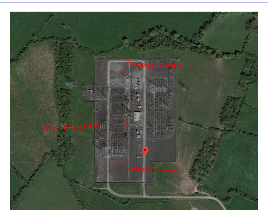
Figure 3: 400kV Ring Configuration