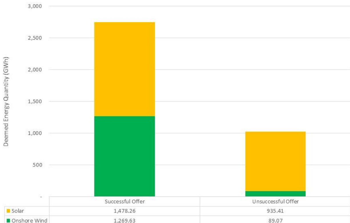
Figure 1 Deemed Energy Quantity Provisionally Successful and Unsuccessful by Eligible Technology

A total Deemed Energy Quantity of 2,747.89 GWh was provisionally successful and a total Deemed Energy Quantity of 1,024.482 GWh was not successful. Figure 1 shows the Total Deemed Energy Quantity (GWh) Successful and Unsuccessful by Eligible Technology.