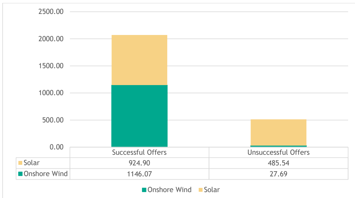
Figure 1 Deemed Energy Quantity Successful and Unsuccessful by Eligible Technology

A total Deemed Energy Quantity of 2070.97 GWh was successful and a total Deemed Energy Quantity of 513.23 GWh was not successful. Figure 1 shows the Total Deemed Energy Quantity (GWh) Successful and Unsuccessful by Eligible Technology.