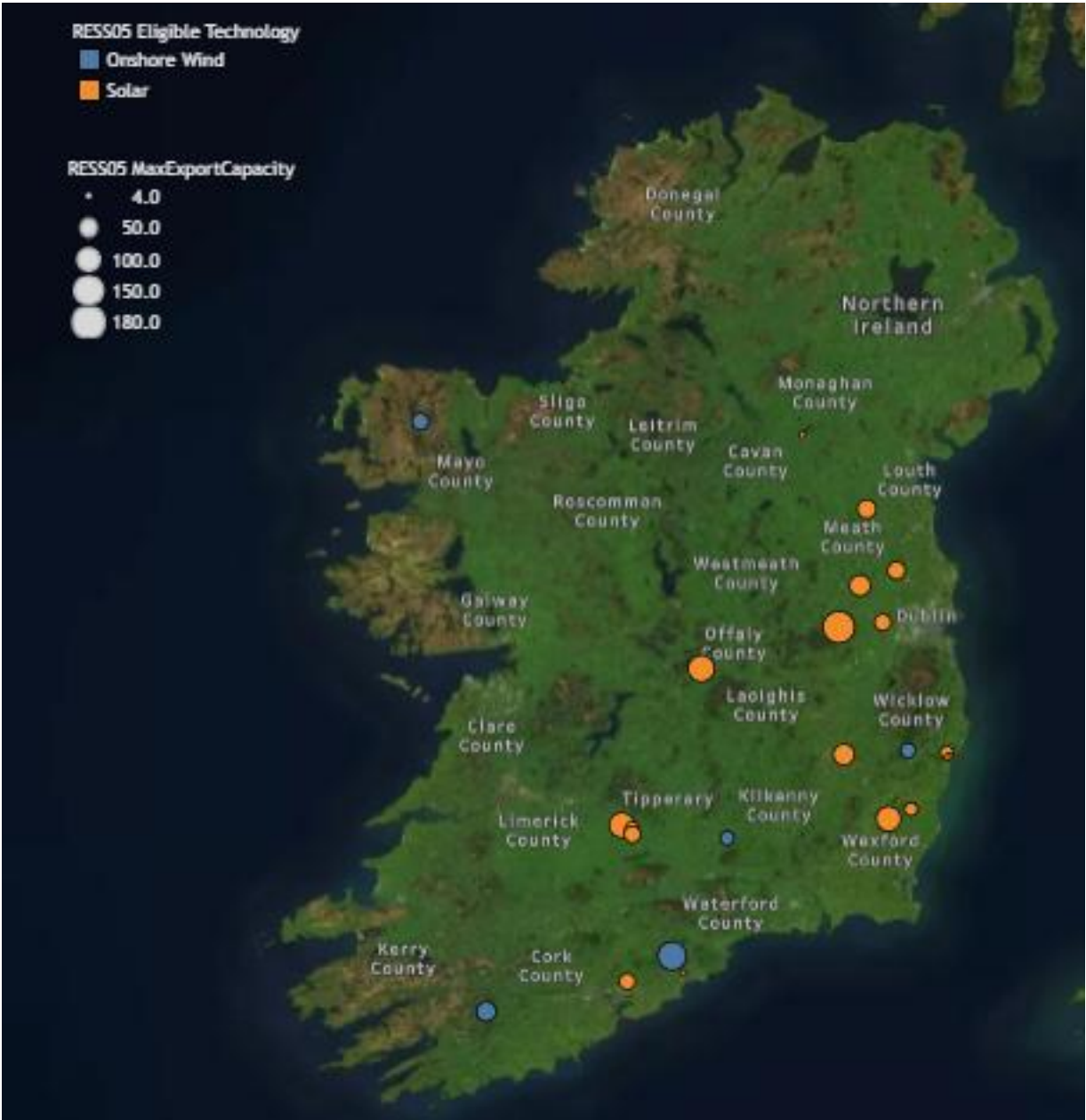
Figure 3 Location of RESS 5 provisionally successful projects by Eligible Technology

Figure 3 shows the location of each provisionally Successful Project by Eligible Technology.